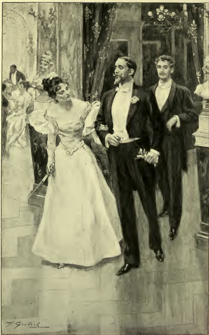
She leaned upon his guest's arm, chatting confidentially. [p. 95.]